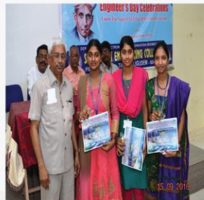
Winners of Project Exhibition receiving prize from Director