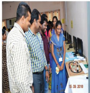
Automatic Railway Gate Controller