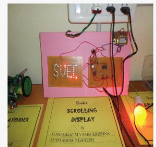
A project developed by Space Centre team