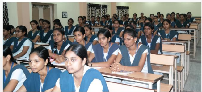
Students gathered for Guest Lecture