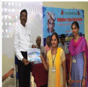
Winners of Paper Presentation receiving prize from Secretary & Correspondent