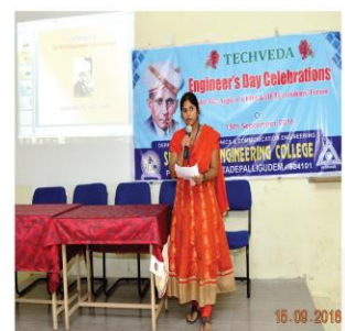
III year student delivering a brief note on Sri Mokshagundam Visveswaraya