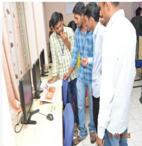
Scrolling Display Project

Paper Presentation Project Exhibition Technical Quiz