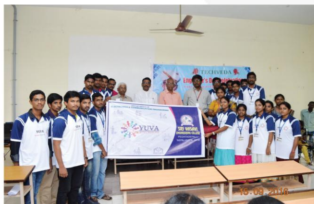
Management and Head of ECE inaugurating the logo and banner of YUVA