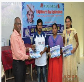
Winners of Technical Quiz receiving prize from President