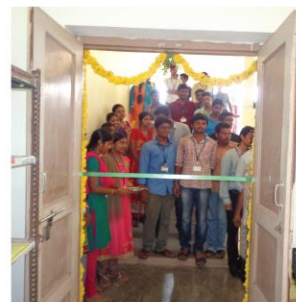
Students gathered for opening ceremony of Isaac Asimov Space Centre