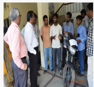
An exhibit at the Project Expo