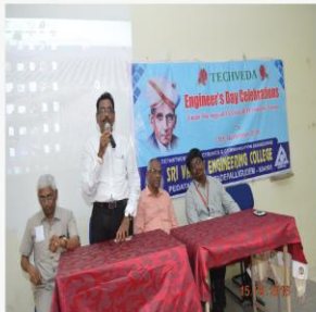
Secretary & Correspondent addressing the gathering