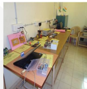
Inside the Isaac Asimov Space Centre