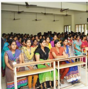
Students gathered for Guest Lecture at JC Bose Hall of Learning