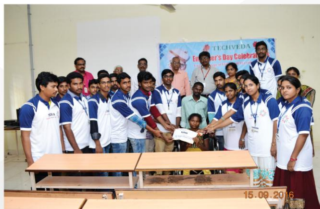
Team YUVA donating Money to the Paralysed person

As a part of this program, the students have donated an amount of Rs. 10,000 to a physically challenged person from a poor family