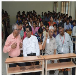
Management & Directors at the opening ceremony