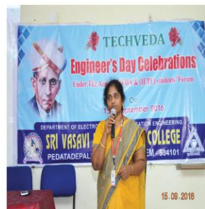
Head of the Department addressing the gathering

VEDA- Victorious Electronics with Dynamic Aspirants, association of ECE, had organized Engineer's Day on account of birth anniversary of his excellency Sir Mokshagundam Visveswaraya on 15th September, 2017.